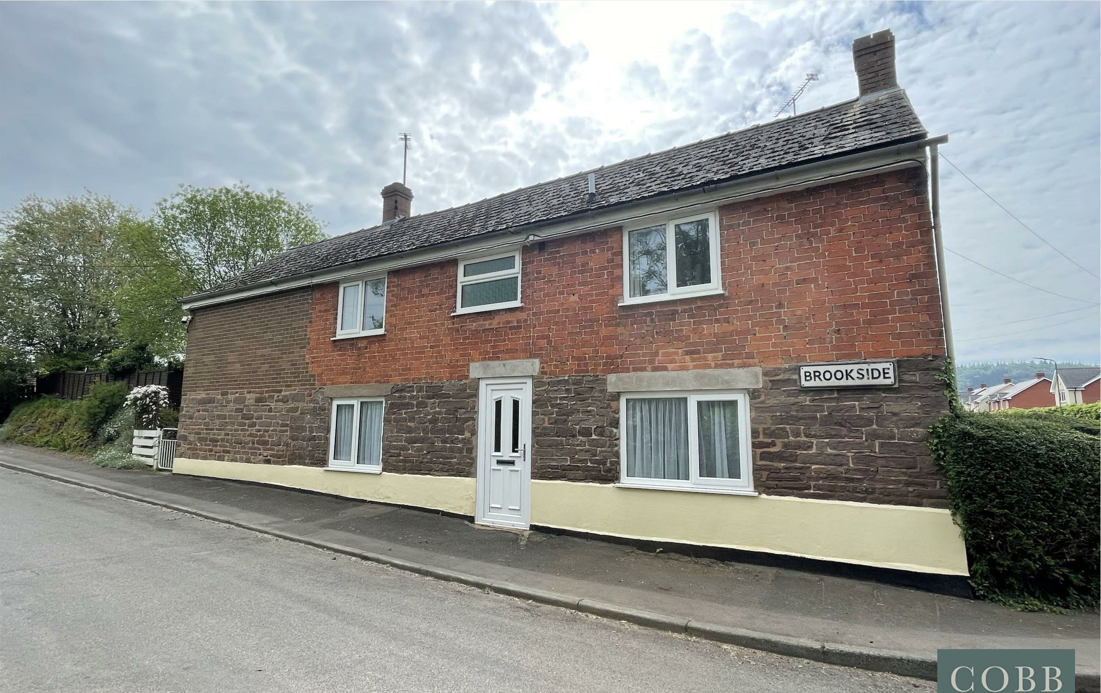
Brookside Cottage, Canon Pyon, Hereford, HR4 8NY Price £225,000